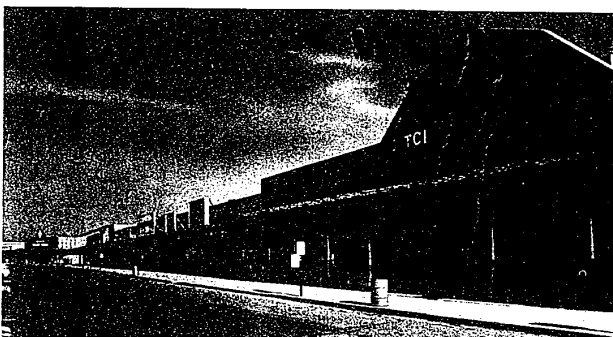
Miracle Mile Shopping Center at Square Lake and Telegraph has begun a campaign to change its image and attract new shoppers.