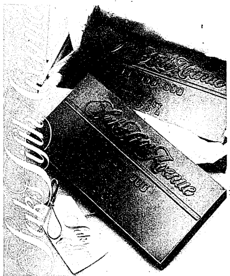
'SFAvorites! Here, executive sweets: your very own Saks Fifth Avenue charge plate, rendered in mouth-watering milk chocolate. One full pound; $27.50. In the Guest and Gift Shop and 'SFAvorites, where we are all the things you are...gifts just right for you.