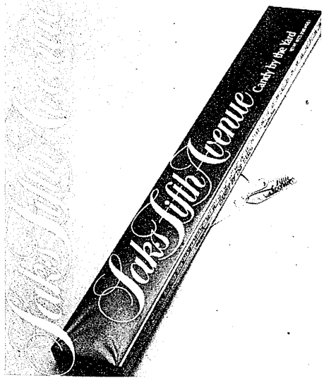
'SFAvorites! Here, Saks' exclusive Candy by the Yard. One whole full yard of bite-size, assorted individual chocolates, packed in our very own gift box. 2 lbs., 14 oz.; $22.50. In the Guest and Gift Shop, 14 East 50th Street and 'SFAvorites, where we are all the things you are...gifts just right for you.