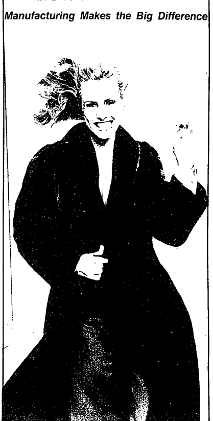
Extra dark Canadian Mink with the pencil look from the Gervais Collection.

DUTY & SALES TAX REFUNDABLE, MUCH LOWER PRICES FOR QUALITY FURS, PLUS EXCHANGE ON U.S. FUNDS, PRESENTLY AT 15%.