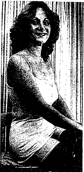
'Sauggies' also in silk are from Under-it-all and can add a touch of whimsy, even glamour to your gift giving.

At Under-it-All, the lingerie boutique in Franklin Village, there are pure silk knit underthings with a true air of quality. Soft and silky, but very warm, the West German imports are sleek under wear for