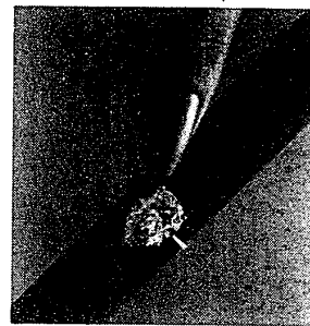
Diamondair 11™ — in all its dazzling clarity! A treasure produced by man that so rivals the beauty of nature's real diamond... that the two are nearly indistinguishable! Here, the pear-shaped ring: its 58-faceted cutting, the same as that of a real diamond, transforming it into a blaze of fire and ice! 5 cts., $425. Everything in weights of over 3 carats, $85 per carat. In Fine Jewelry Collections — where we are all the things you are... gifts just right for you. Photograph enlarged to show detail.

Sak's Fifth Avenue — Mime Time is presented from noon to 4 p.m. in the mall.