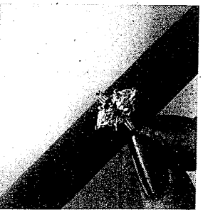
Diamondair 11™ — in all its dramatic depth! It's as if man captured all the brilliance of the heavens and the intimacy of the heart for a stone that would almost duplicate the diamond! Here, the ultimate simulated jewel: the marquise cut ring, set with tapered baguettes. 3 cts., $255. Everything in weights of over 3 carats, $85 per carat. In Fine Jewelry Collections — where we are all the things you are... gifts just right for you. Photograph enlarged to show detail.