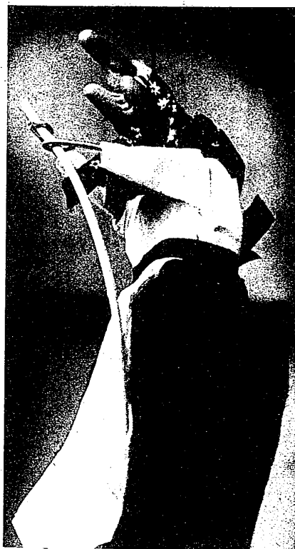
Riding into your kitchen, this witch promises luck.