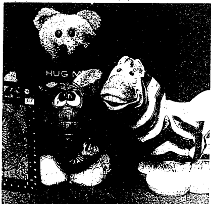
Companions like this elephant in tennis shoes, sheepish zebra and huggable teddy bear can brighten up a small corner.

Good old fashioned water colors are priced at under $6 and come in a large table size or small pocket book style.