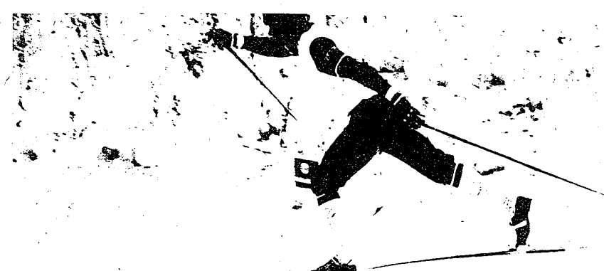
Cross country ski instructors, all members of the Professional Ski Instructors Association, will show how its done in a new series of classes that leads off with a Ski Clinic. The clinic gets under way at 7:30 p.m. Friday, Jan. 4, in Farmington Community Center. It is open for all persons over the age of 8.

Old newspapers should either be bundled, or placed in a large brown paper grocery bag.