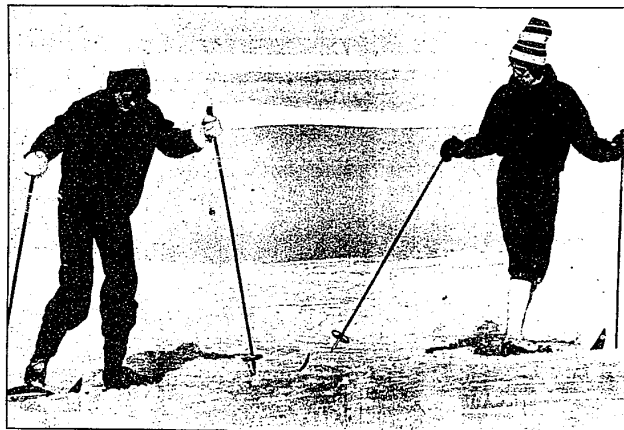
A student (left) practices her technique while her instructor looks on. Beginners can learn the basics of cross country skiing in a matter of hours.