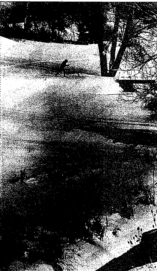
A skier finds a moment of solitude on the snow scape of a local park.