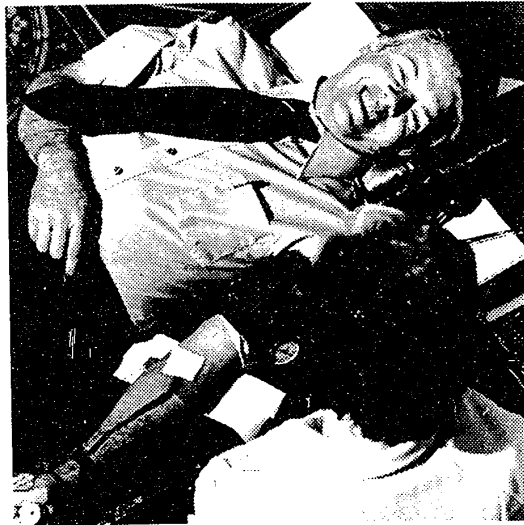
President Jimmy Carter signed up 51 times.