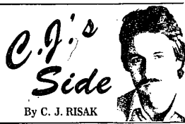
By C. J. RISAK

Fouled out: Anderson (FIS). SALEM HARRISON 24 29 19 12 -84 14 15 3 7 -39