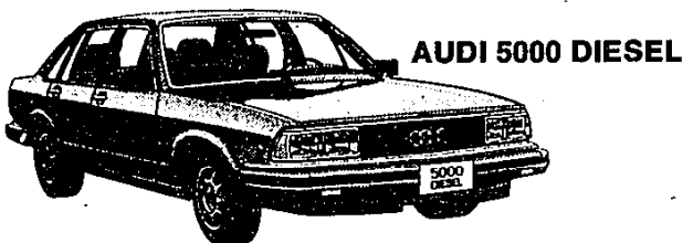
AUDI 5000 DIESEL