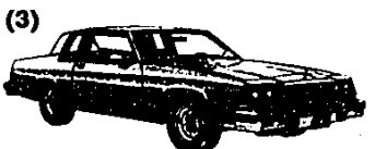
NEW 1980 BUICK LE SABRE 2 DOOR COUPE AIR CONDITIONED

Full factory equipment plus the following luxury options: Economical V-6 engine, automatic transmission, power steering and brakes, tinted glass, AM radio, steel belted radial white walls, deluxe full wheel covers and left remote mirror.