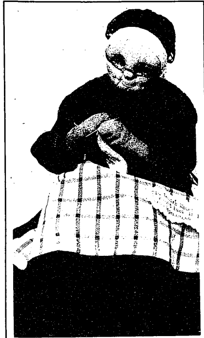
This doll portrays an elderly Danish woman sitting with her knitting.