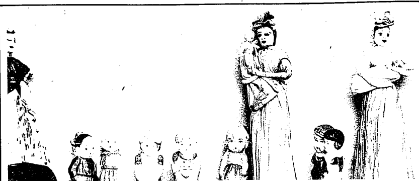
A miniature family of corn husk dolls and tiny Dutch figurines peer out at passers-by.