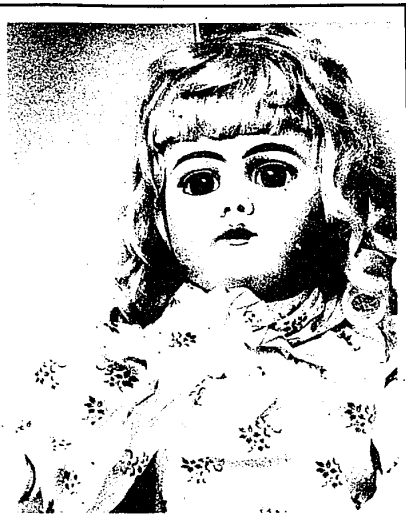
The blonde doll clutches a fan and displays a pert party dress.

Adults and children have long been fascinated by the world of dolls.