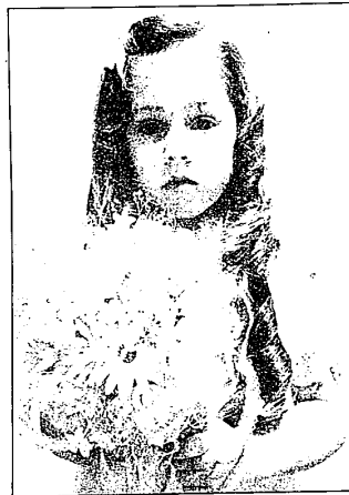
Traditional bouquets are still popular for weddings.