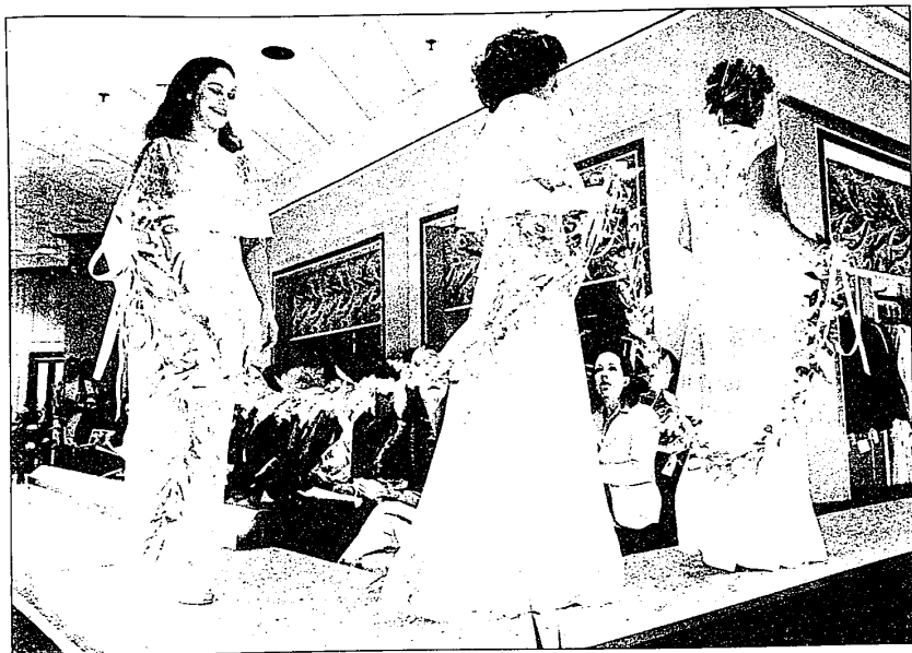
A garland of silk lilies of the valley is carried by these bridesmaids, who wear floral jersey gowns.