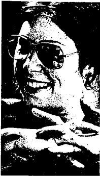
Diana Canova wants to do "quality things."

Ms. Canova said she studied stage for five years. "Any type of theater you