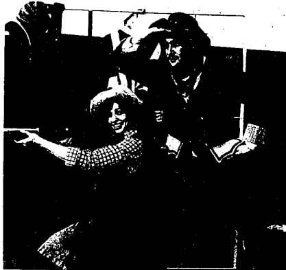
Calamity Jane and Johnny Flint sing, dance and spoof their way through "Sing America!" which will be presented at Farmington High School.

The scenes run from wilderness to homeland, from rough pioneers to settled families with towns and communities linked by the railroad.