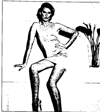
Vassarette's short slip is the new inside length alternative. The chemise is one smooth line that stops short so it won't show beneath slits and slashes.

As shape returns, there is a new and now emphasis on the body. Old-time girdles, waist cinchers and merry widows will never fit in with today's feminine psychology. However, no body is perfect, and those unwanted bulges must be smoothed for more revealing clothes so that natural body curves can be seen.