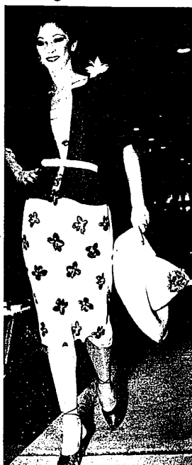
A padded shoulder "magic marker" sweater tops a print strapless dress.