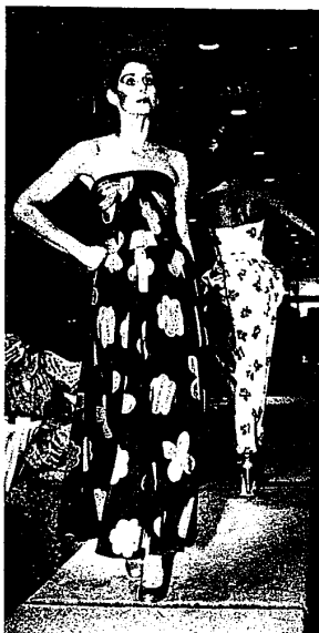
Chloe's slender black and blue flowered print has its waist cinched in bright yellow leather and is worn with red shoes.

Chloe designer, Karl Lagerfeld, lengthened his long slim lines with amusing placements of fresh flowers when he showed his spring/summer collection at Saks Fifth Avenue, Troy. No little blossoms were tucked behind the ear. Instead, he used sprigs of forsythia like plumes in the hair.