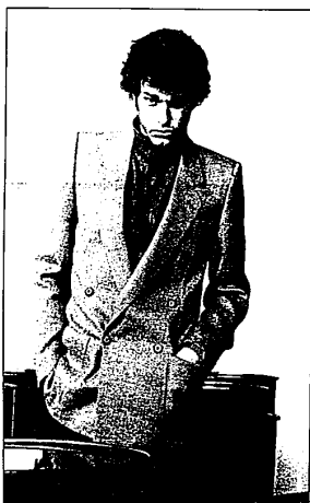
The long, lean look — brown and natural, wool and Indian hemp tweed double-breasted jacket over grape linen funnel-neck shirt and deep brown leather jeans. Me & My Lady, Tweed's.