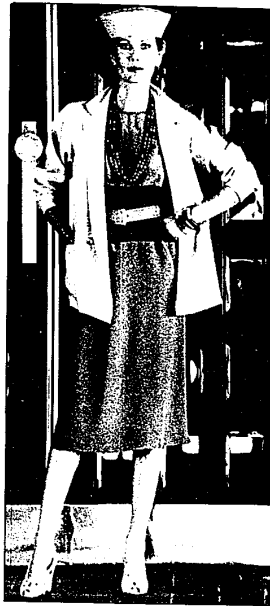
'Amapollo, My Pretty Little Poppy' accompanies Piero Dimitri's poppy red and orange crepe de chine tube dress with double breasted jacket of beige linen. Togue and shoes are also linen. Saks Fifth Avenue.

283 Hamilton • Birmingham • 644-7626 Open daily 9:30-5:30 Thursday evenings 'til 9