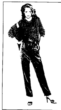
'Green Eyes' will surely follow eucalyptus silk charmeuse pants combined with a matching colored handknit cotton muscle T-sweater and popcorn stitched cardigan by Anne Klein. Bonwit Teller.