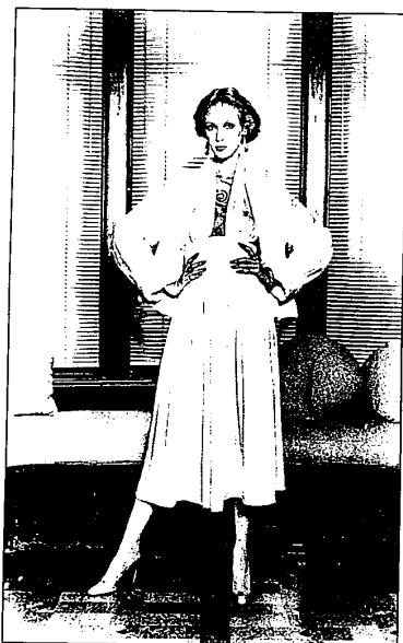
Strains of 'Satin Doll' will haunt the night when the sensuous woman steps out in hand woven white silk satin. Dress is from the custom collection of Austin Zuur, Ltd., New York.