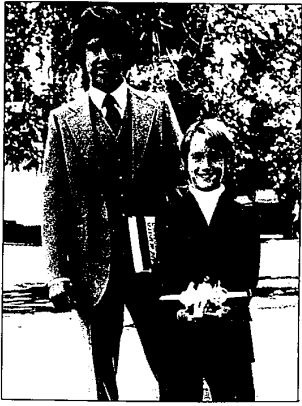
'Softest touch since Mom' is how boys describe the new fabric called 'Omega' that Chips 'n Twigs is using in its clothing. It's a pleasure to get dressed-up when it's a three-piece suit in junior and student sizes. J. L. Hudson's.