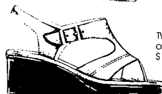
TWIRLER - In bone, camel or white smooth. $21