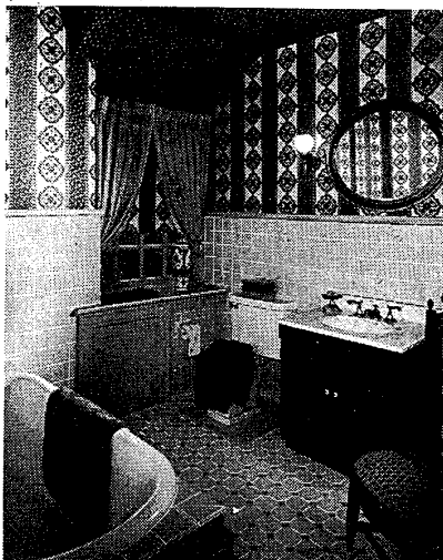
A no-fuss, traditional bath such as this American Olean version is for persons scoring mostly B's.

If you're the C-type, send 25 cents for the Tile Council's booklet on do-it-yourself tiling.