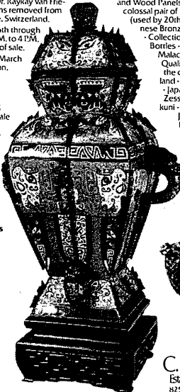
Massive 17th Century Chinese Cloisonne Imperial Palace Vase. Design of the faces. Late Ming. 44" high with stand. (One of a pair).

of art: A Large Collection of Cloisonne including a pair of Pelicans, Griffins, and Swans all Chia Ching (1798-1821). 18th Century Plaques, Chargers and Vases - 17th Century Ming Dynasty and 18th Century Chinese and Japanese Porcelains, Satsuma, Imari, Peking Glass - 18th Century Wood Carvings and Wood Panels - Bronze Figures and Buddhas including a colossal pair of 18th Century Bronze Imperial Palace Vases (used by 20th Century Fox in movies). 17th Century Chinese Bronze Lamp, 15th Century Thai Seated Buddha - Collection of Jade Jewellery - Rare 18th Century Snuff Bottles - Exceptional Jade and Hardstone Carvings: Malachite, Rhodonite, Lapis, Amethyst, Museum Quality Ming Dynasty Soapstone Carvings from the collection of Professor Ganz, Bern, Switzerland - Collection of Early Chinese Fans and Scrolls - Japanese Woodblock Prints. Works by: Shibata Zeshin, Hokusai, Sukinobu, Shuniei, and Toyokuni - Several Screens including an 18th Century Japanese 4 Panel Screen-Isoa School and a 17th Century Ming 6 Panel Screen - Chinese Paintings: Large Chien Lung Oil of Mandarin and his two wives and Emperor and Empress on Silk - Collection of Rare 18th Century Netsukes - Silks - including a rare Japanese 17th Century Noh Actor's Robe - Wall Hangings, Kimonos and Coats. This is a very large, diversified collection of fine oriental antiquities.