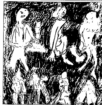
Figures in Kathy's charcoal drawings improved dramatically in both concept and skill. Her work shows an increased awareness of self through the definition of body parts and their function.