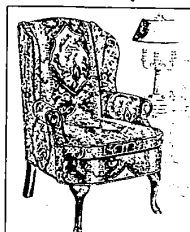
Wing Chair available by special order in velvets, prints and combinations. $289.00 ea. 2 for $559.