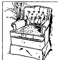
Lounge Chair displayed in choice of three velvets. $259.00 ea. 2 for $499.