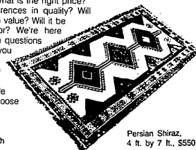
Persian Shiraz, 4 ft. by 7 ft., $550.