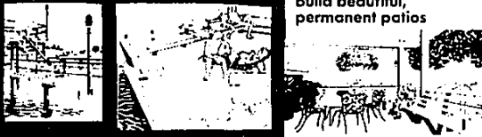
Build beautiful, permanent patios