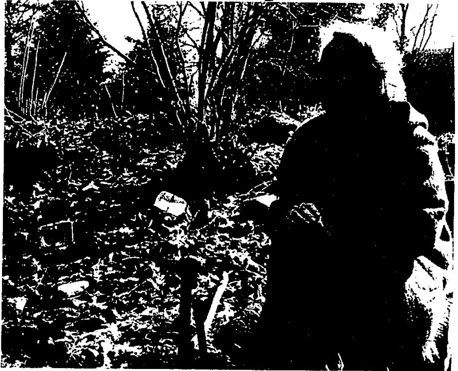
Waiting for spring to pull her wild flowers up high enough to see is Florence Adamson of