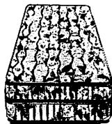
ELITE $179 95 TWIN (ea. piece)