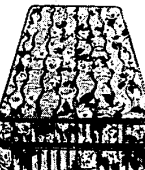
EXQUISITE $420 00 TWIN (2 piece set)

Come in and select the Beautyrest that's best for you.