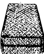
SUPER LUXURY FIRM $149 95 TWIN (ea. piece)