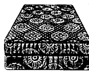
BACK CARE $179 95 TWIN (ea. piece)