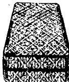
SUPER EXTRA FIRM $149 95 TWIN (ea. piece)