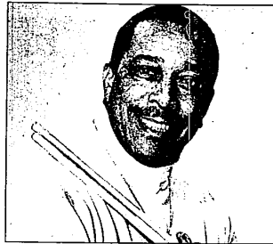
J.C. Heard, jazz drummer, opened a three-week stay Monday at Merrick's in Southfield.

He has been a regular on the Hilton Hotel circuit, appearing at those hotels in Dallas and Atlanta.