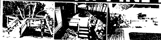
Solano, Old Point.