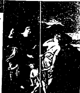
KPM plaque "Hagar and Ishmael leaving House of Abraham", Impressed KPM & Sceptre, 19th cent. 11" x 13 1/2". Sun. #33

Friday evening May 18th at 7 p.m. Saturday morning May 19th at 11 a.m. Sunday afternoon May 20th at 12 noon