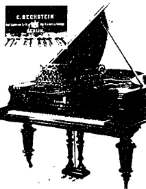
Parlor Grand Piano by C. BECHSTEIN, Berlin Germany, Circa 1885. M. Black ebony case. Sun. #59.

Friday evening May 18th at 7 p.m. Saturday morning May 19th at 11 a.m. Sunday afternoon May 20th at 12 noon