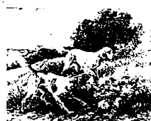
Edmund Osthaus, oil on canvas, Size 18" x 24". Sun. #88

FREE VALET PARKING for the Friday evening and the Saturday auctions.