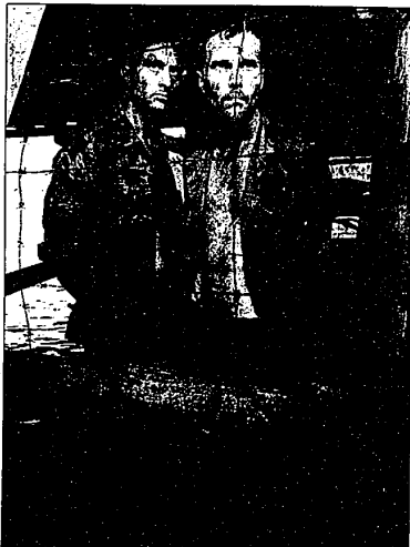
Michael (Robert DeNiro) and Steven (John Savage) are prisoners of war for a time, in the Academy Award-winning film, "The Deer Hunter."