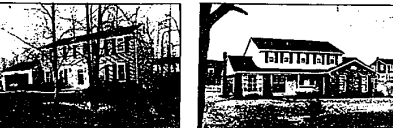
"ROLLING OAKS" Trees, trees, trees. Picturesque colonial nestled amongst the woods featuring contemporary decor, 4 bedrooms 2 1/2 baths, family room, wood deck, cement patio, central air and good assumable mortgage - a real cream puff. OWA $117,000 851-1300