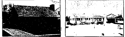
MODERN AND UNIQUE A unique and modern Cape Cod in lovely Lathrup Village. Three bedrooms, 2 full baths, paneled den, cape heat-Antonioli Built - Central air - 2 car attached garage - Modern Country Kitchen - finished recreation room and more. $89,900.00 SSU 559-8181.