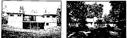
COUNTRY ATMOSPHERE Marvelous four bedroom home on over three acres. Spectacular view of Bunde Lake from terrace of living room. Full convenience kitchen. Separate dining, family room, fireplace, recreation room, and extra kitchen. $134,900. SUU 363-7155