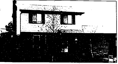
SHARPIIIII FAMILY COLONIAL Sharply decorated with contemporary wall paper, window treatments & carpeting. This home is perfect for a young family, fenced yard, central air. Elementary school in sub. MWA $67,900 851-1300