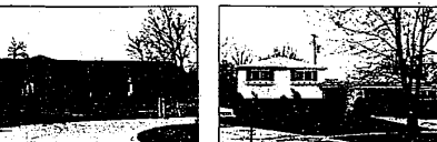
WOODSTREAM FARMS Large private lot, wood deck with double gas Barbeque, wet bar in family room, walk-in pantry, custom built Quind level. Ceramic tile in foyer, large country kitchen, sprinkler system. Lovely contemporary home with many quality features. $159,900 WFI 851-6000