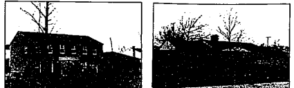
IMMEDIATE POSSESSION WITH LIBRARY New, well-maintained home situated on a lovely wooded lot. This 4 bedroom, 2 1/2 bath family and library home has central air and 2 parks within the prestigious subdivision. Don't miss the huge recreation room and garden kitchen. CALL NOW LWE $135,900 851-1300