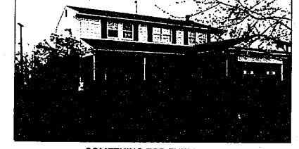
SOMETHING FOR EVERYONE Spacious 4 bedroom colonial on a beautifully landscaped lot in Southfield Gardens, features central air, sprinklers, fantastic kitchen with large breakfast nook, beautiful family room with brick wood pegged floor and full wall fireplace $95,000 OSM 559-8181