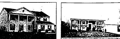
PLAN AHEAD Beautiful 4 bedroom, 2 1/2 bath colonial in prime W. Bloomfield area. Family room & live professional landscaping with underground sprinklers surrounds large deck and tree front brick patio with gas BBQ. October occupancy. $119,500 FWO, 851-1300