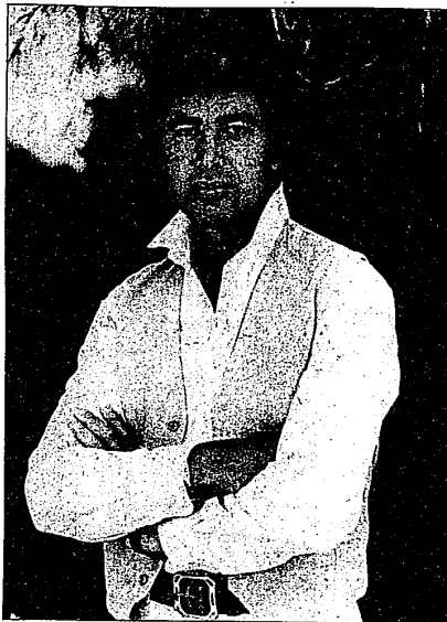
Engelbert will appear June 18-21.

July 4-7 — THE BEACH BOYS, 8 p.m., (July 4, 5, 6, lawn only, July 7, pavilion, lawn).