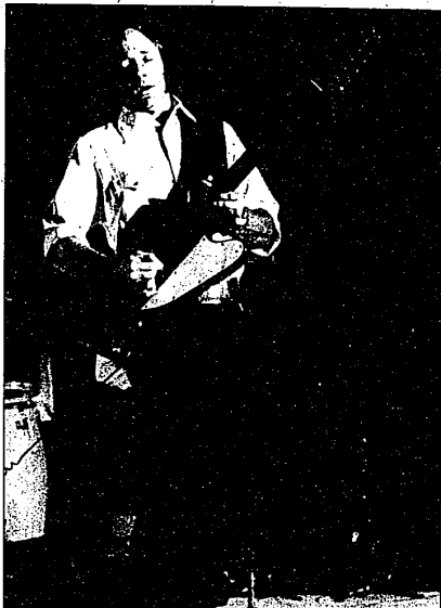
Stephen Stills will perform June 17.

The Marshall Tucker Band will open the summer season at Pine Knob at 7:30 p.m. Friday, June 8.