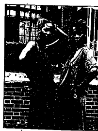
Butter soft suedes by Rogerio Brazil were Linda Dresner's contribution to the festivities. Asked if they were comfortable, the Dresner models gave enthusiastic "Oh, yes."