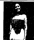
UnderitAll's strapless petal top and cotton voile watercolor print skirt is an Ariel bathing suit design.