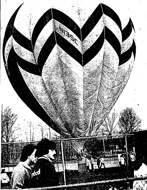
Colorful hot air balloons are becoming a familiar sight as more people are finding experience.

"Anyone that's crazy enough about balloon flying to want to own one."