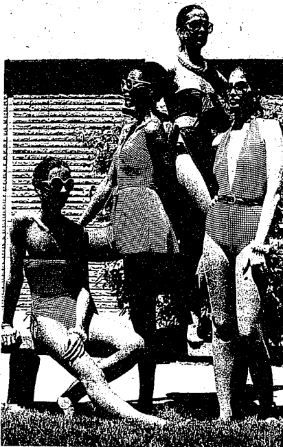
Raisin and white Cole of California bathing suits include styles with skirted leg (left), skirt, bandeau and bikini and belted design.

The tall slender models pictured here wear dresses that are size 9 or smaller. But, because of their body length, they're all wearing size 12 swim suits.