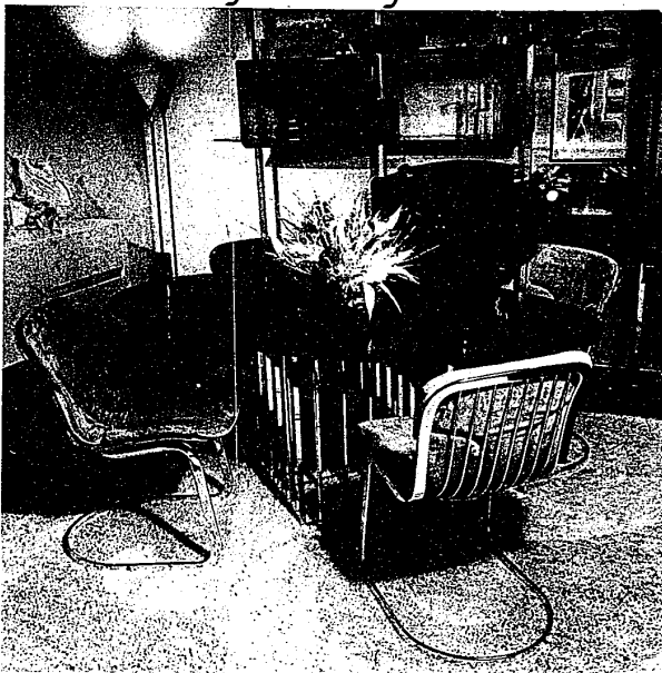
Photographed at Roche Bobois in Birmingham.

And you thought you couldn't find furniture style to keep up with your life style.