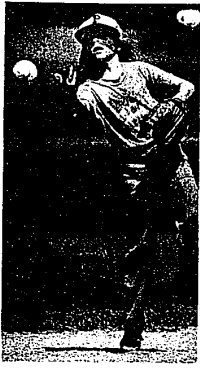
A graceful move is made from the pitcher's mound by Shawn Armstrong.