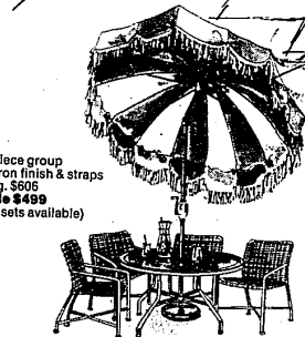
5-piece group Citron finish & straps Reg. $605 Sale $499 (24 sets available)

Now you don't have to settle for anything less than Tropitone for your patio. Because now, at Englander's, two of Tropitone's best patio sets are each more than $100 less. And because they're by Tropitone, you know they haven't settled for anything less than bonded thermoplastic finish over lightweight aluminum, durable high-strength acrylic tops, and more. And there are matching chaises and lounge chairs at similar savings for both groups, too.