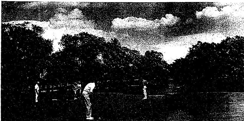
The 17th hole at Oakland Hills Country Club will be somewhat more congested than in this view when the Professional Golfer's Association (PGA) Championship moves into the area the end of July.