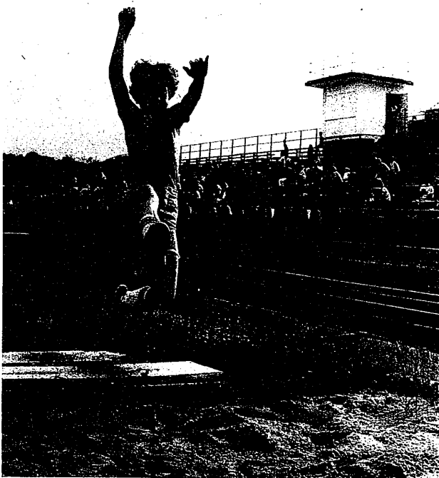
The long jump is just one of the events in Farmington's fourth annual Youth Fitness meet.

For further information, call the Parks and Recreation Department at 474-6115.