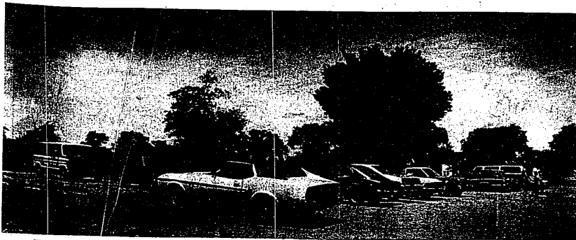
The vacant lot along Chester between Maple and Merrill only will be open to visitors of the city's historic Allen House because of city regulations.