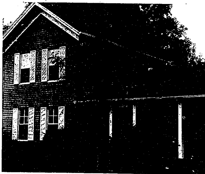
This home, located at 33221 Oakland, was built in 1846. The house sits over a stone cellar with hand-hewn timbers.

It is said the tavern, under Quaker ownership, was a stop on the Underground Railway.