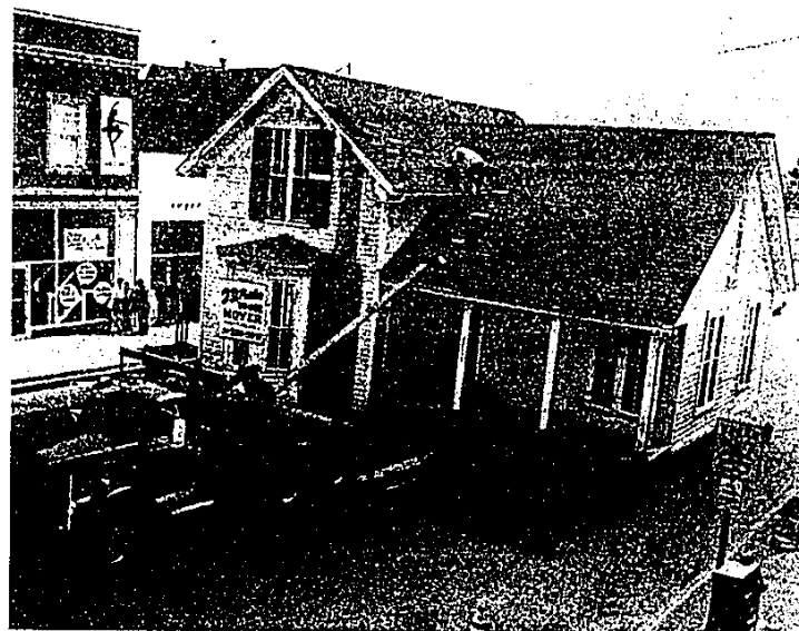
Residents of Farmington care about their heritage. Recently, this historic home founds itself in the way of progress, so it was moved from Farmington Road to Shiawassee.