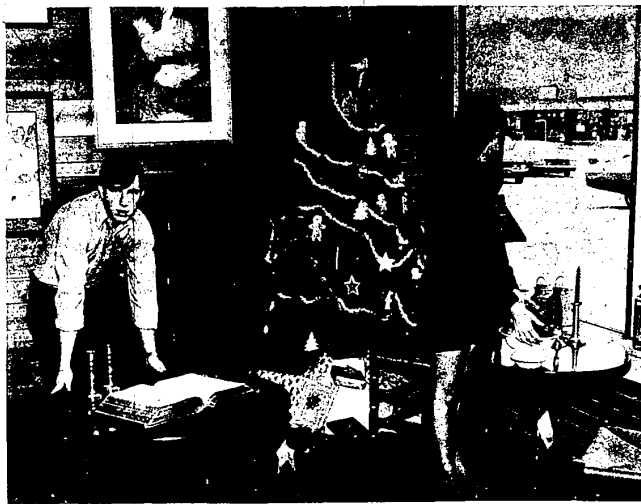
HOLIDAY MOOD - Putting holiday touches on the front window of the Ebenezer Shop in the Downtown

Little Caesars Pizza Treat 32905 Northwestern Hwy. Farmington