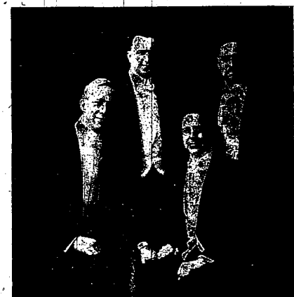
The J. L. Hudson Male Quartette Which Sings in Town Hall Sept. 17

"No reduction has been made in the price of the Fordson tractor, and none is contemplated."