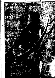
View of Car From Above.