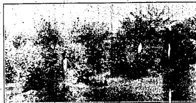
Same of the Apple Trees

Which Alone Will Pay a Dividend on the investment.